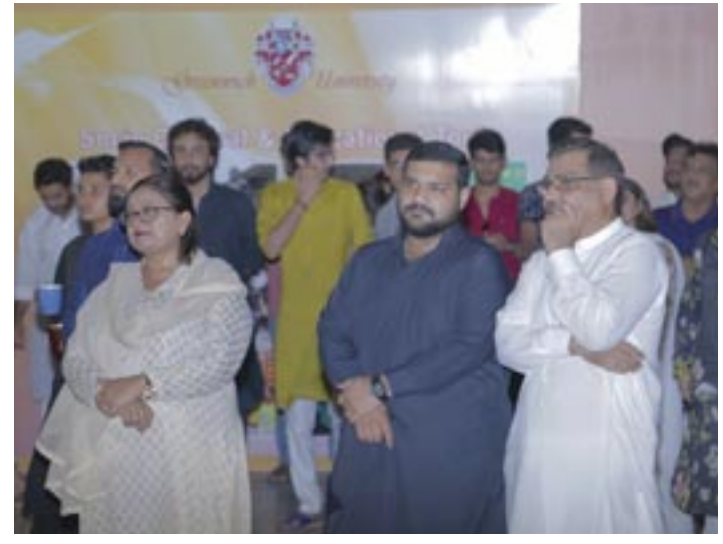
society initiatives across global fora to advocate Kashmir's right to self-determination. A large number of students, faculty and guests attended the event commemorating Pakistan's Defence Day and expressing solidarity with Kashmir.

The seminar resolved that Indian economic diplomacy must not be allowed to hegemonize the discourse on Kashmir and should held accountable for its carnage in Kashmir. The seminar also emphasized that governmental efforts must be complemented by civil