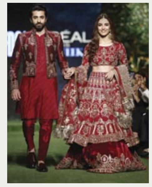
piece to take inspiration from.

The designer brand certainly shook bridal couture up and we adore it for that. Their Golestan collection was uber modern but in all the right ways. Think bright, vibrant and festive as rich fabrics like tissue nets, velvet and hand-woven silk stood out. A modern take on the old-fashioned gharara teamed with a short shirt took the cake and is a