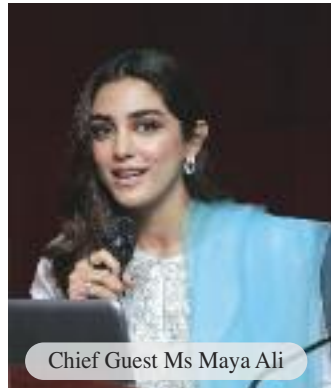
Chief Guest Ms Maya Ali