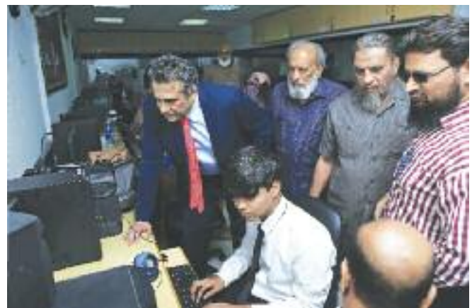
can be beneficial to the Special People