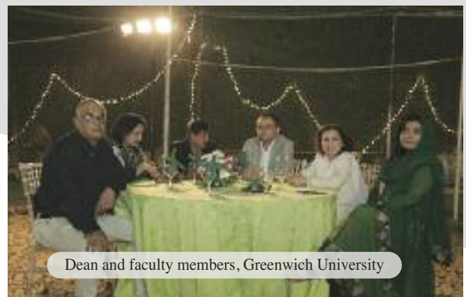
Dean and faculty members, Greenwich University