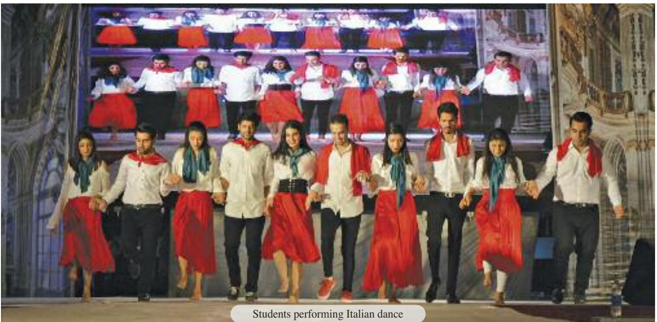
Students performing Italian dance