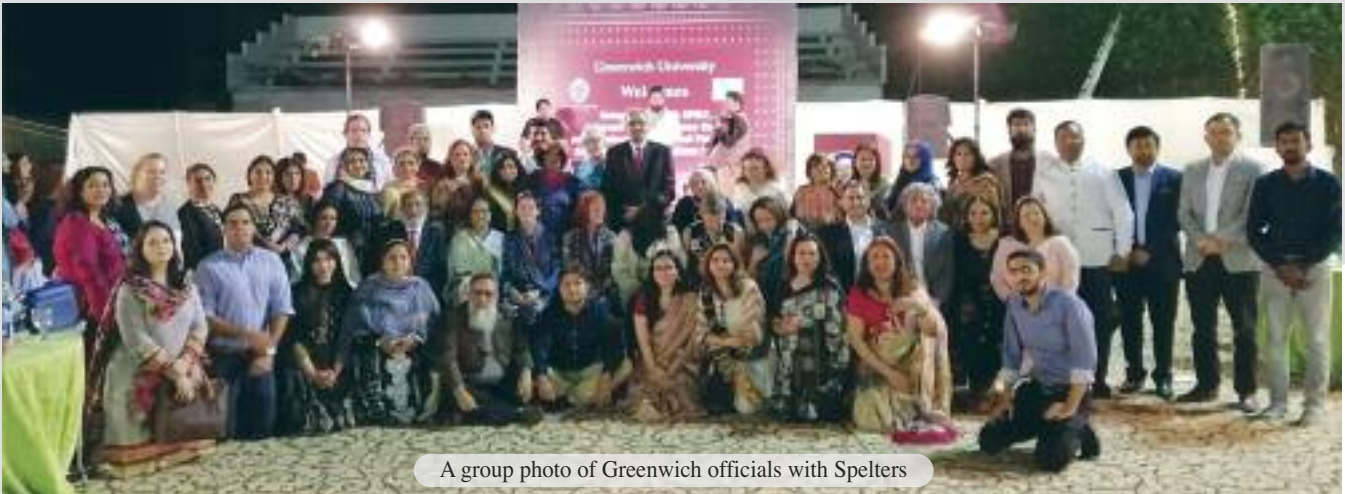
A group photo of Greenwich officials with Spelters