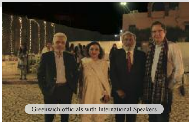
Greenwich officials with International Speakers