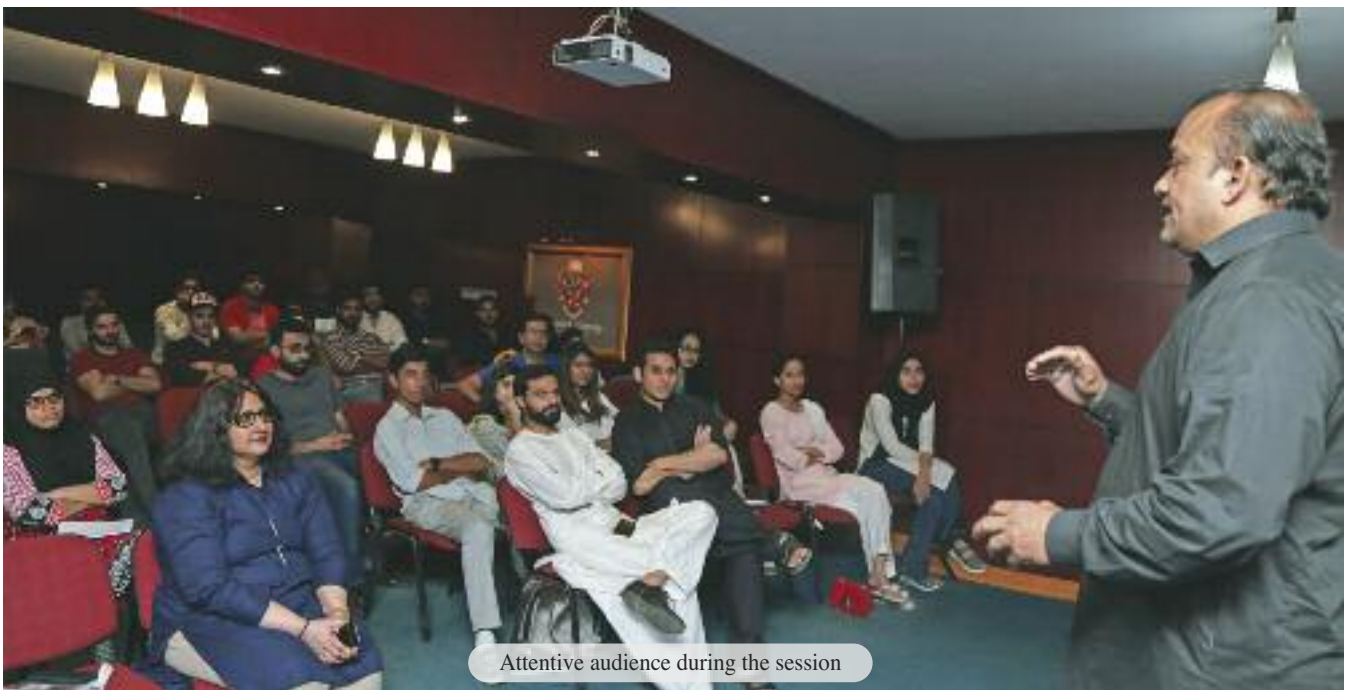
Attentive audience during the session