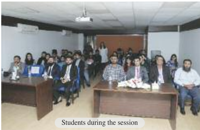
Students during the session

The seminar ended with the Guest Speakers being awarded the token of appreciation and refreshments.