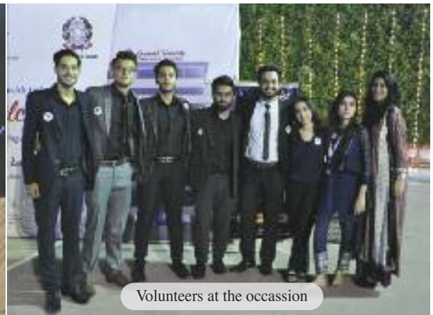
Volunteers at the occasion