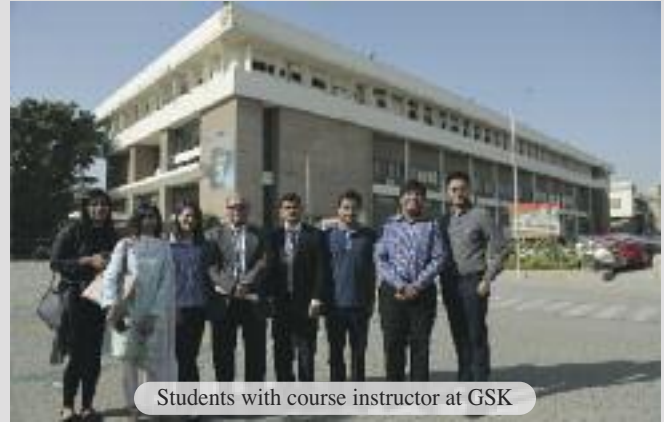
Students with course instructor at GSK

GSK is not only the leading pharmaceutical company in Pakistan, but also worldwide. The corporate strength of this conglomerate can be gauged from the fact that its International President/Chairperson based in Britain has direct access to the British PM; and can fly at short notice, to any subsidiary in GSK's private jet.