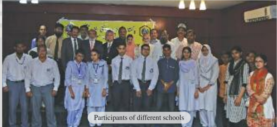
Participants of different schools