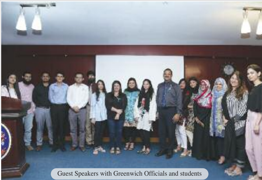
Guest Speakers with Greenwich Officials and students