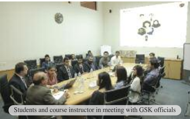
Students and course instructor in meeting with GSK officials