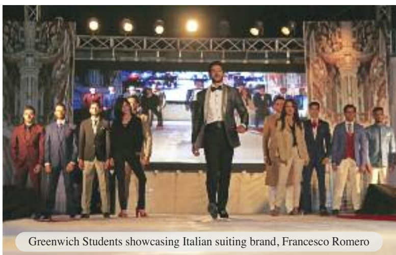
Greenwich Students showcasing Italian suiting brand, Francesco Romero