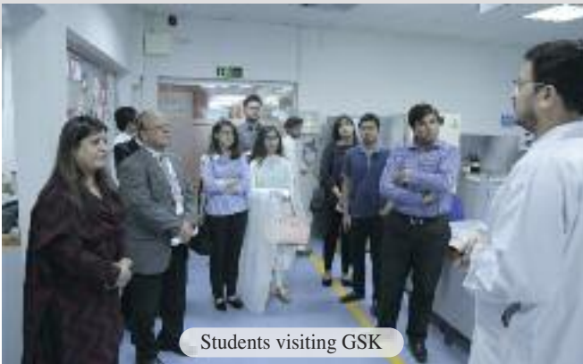
Students visiting GSK