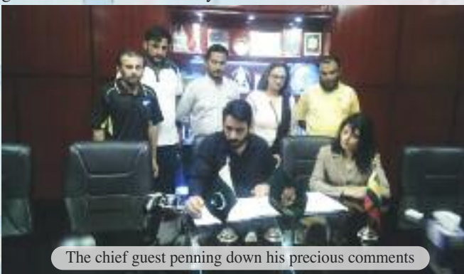
The chief guest penning down his precious comments

In the Semi-final against Al-Jadoon boys Greenwich boys fought bravely, a close match was seen after a good start and get a lead but Unfortunately in the end it was not in the favor