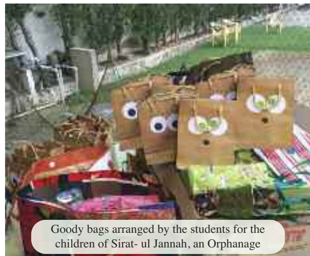
Goody bags arranged by the students for the children of Sirat- ul Jannah, an Orphanage

A few students went to pick kids from the orphanage and brought them to university whereby all the arrangements were Iftar were made by the rest of the students at the campus. When they arrived at the campus, we helped them to settle down and this proved to be an easy task as all the children were very well behaved.