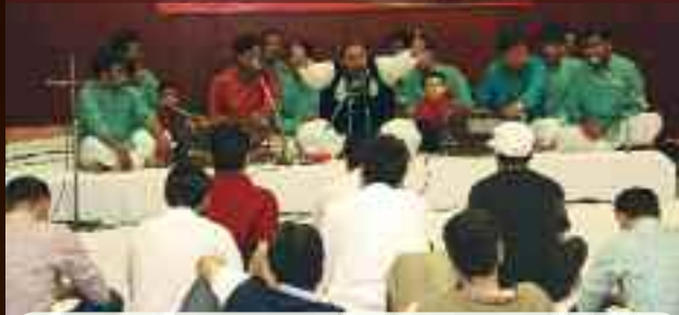
Students mesmerized by the performance of Jugnoo Farid Qawwal