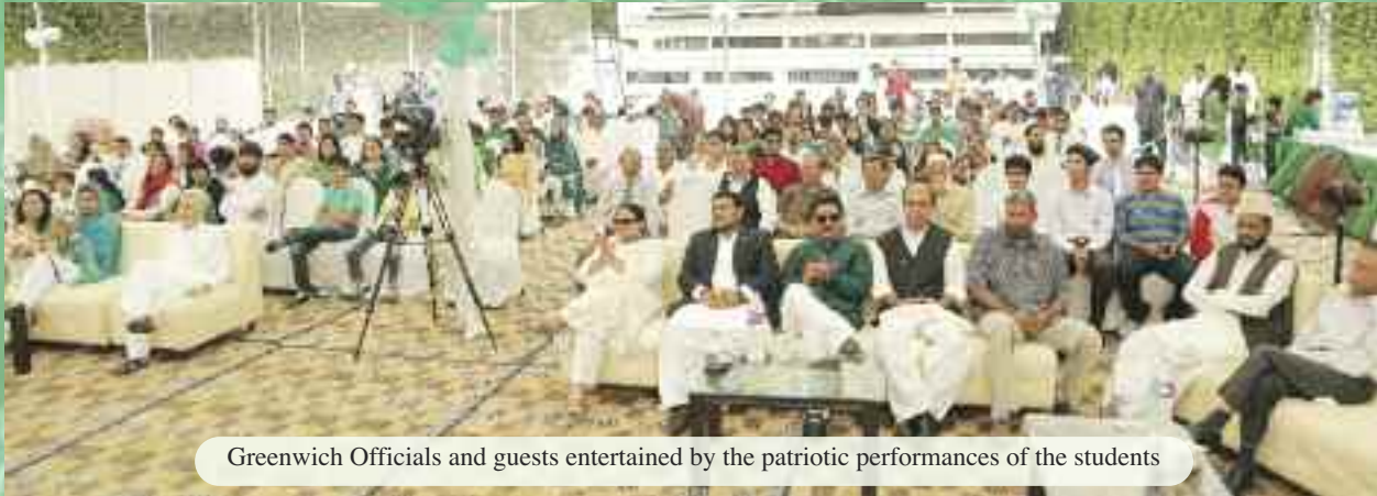
Greenwich Officials and guests entertained by the patriotic performances of the students