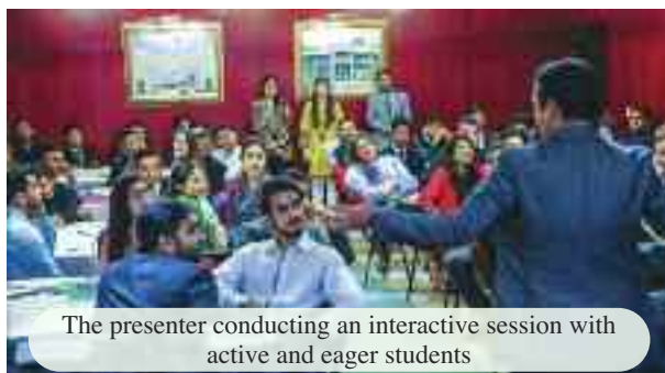
The presenter conducting an interactive session with active and eager students

The purpose of holding this particular session was to gain more knowledge regarding HR and its functions, which will help the participants in a miraculous manner.