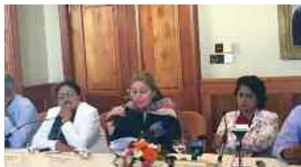
Press Conference being held at the State House in Mauritius

A Press Conference was held at the State House in Mauritius on September 28, 2016, announcing “Pakistan Mauritius Friendship Week” under the patronage of President of Mauritius. The Press Conference highlights held at the State House, Mauritius on September 28,