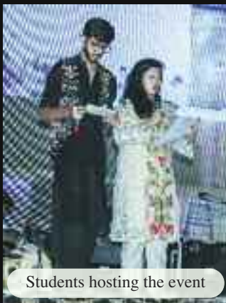
Students hosting the event