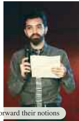
Group representatives putting forward their notions