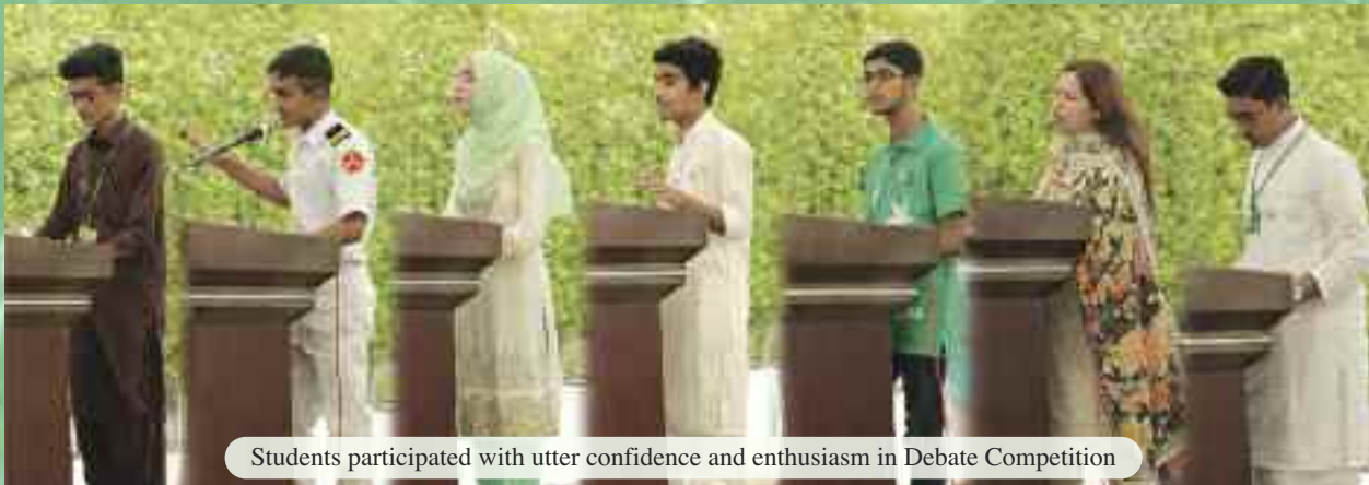
Students participated with utter confidence and enthusiasm in Debate Competition