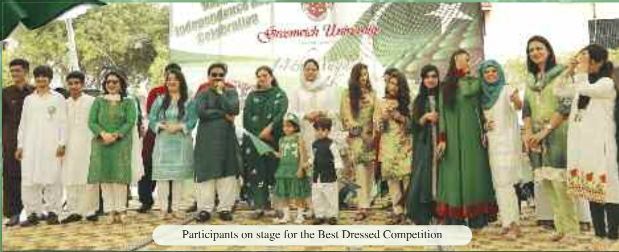
Participants on stage for the Best Dressed Competition