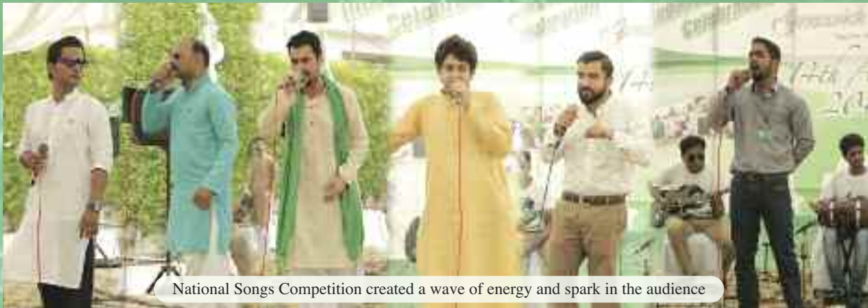
National Songs Competition created a wave of energy and spark in the audience