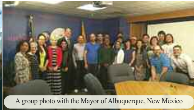
A group photo with the Mayor of Albuquerque, New Mexico

Queens Borough President's Office. Queens is one of the most ethnically diverse middle class neighborhoods in the United States, home to a largely immigrant population from India, Pakistan, Bangladesh, Korea, China, the Philippines, the Dominican Republic, Colombia, Peru, Ecuador, Mexico, Argentina, and a host of other countries. A panel session was conducted there after Ms. Melinda Gates discussion. The panelists were renowned Social workers and Professors of different Universities.