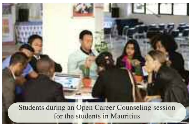
Students during an Open Career Counseling session for the students in Mauritius

Greenwich University organized an Open Career Counseling session for the students in Mauritius. The Counselors provided extensive counseling to the students who visited the session.