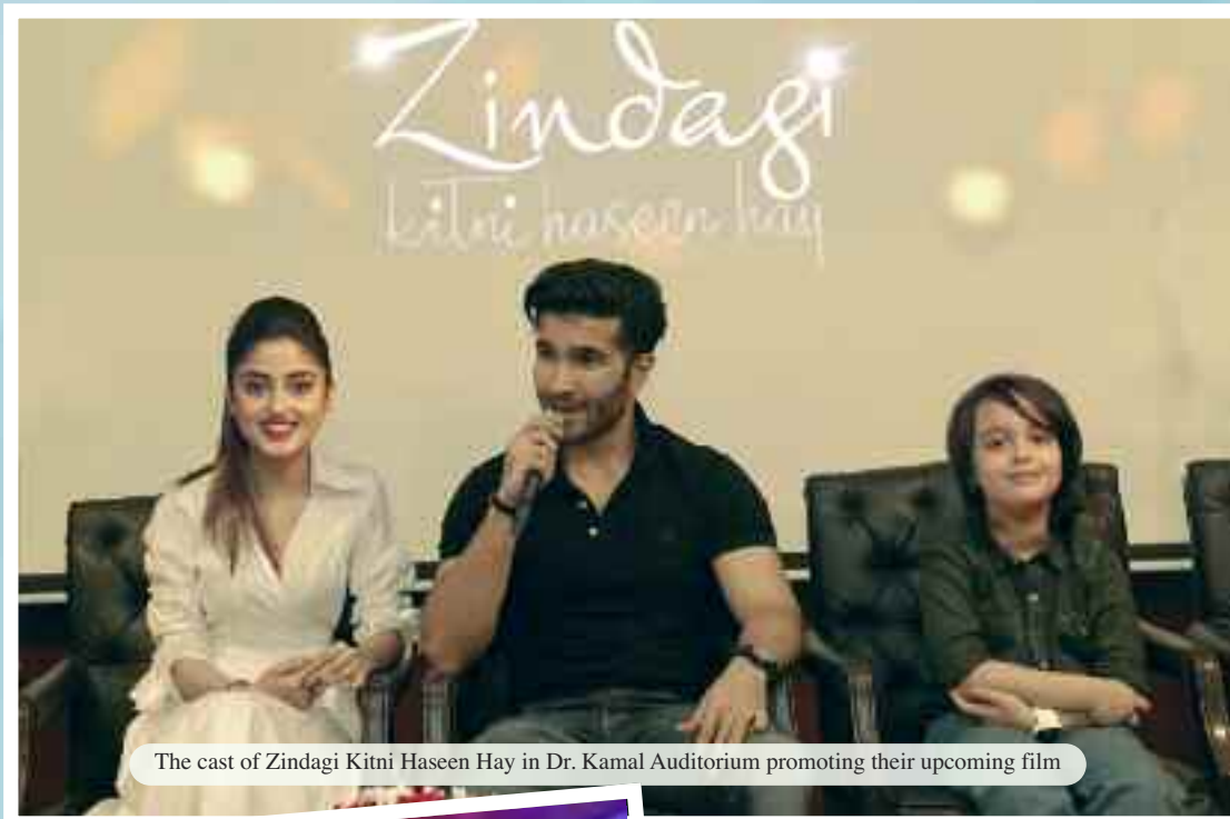
The cast of Zindagi Kitni Haseen Hai in Dr. Kamal Auditorium promoting their upcoming film