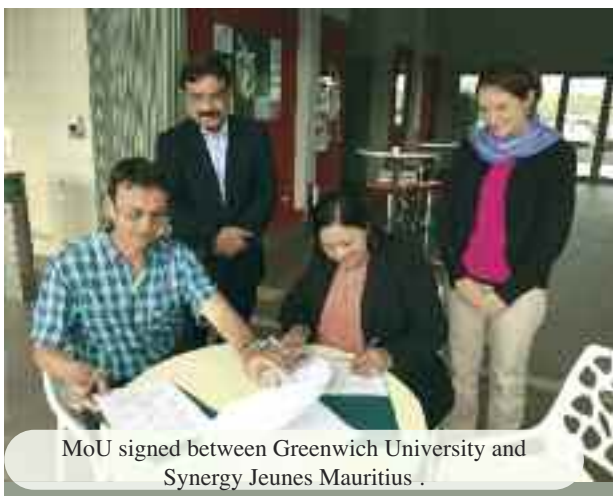
MoU signed between Greenwich University and Synergy Jeunes Mauritius .

On the Annual Function of the Modern College on September 25, 2016 the Chancellor Greenwich University announced extensive merit based scholarships for the students of Modern College.