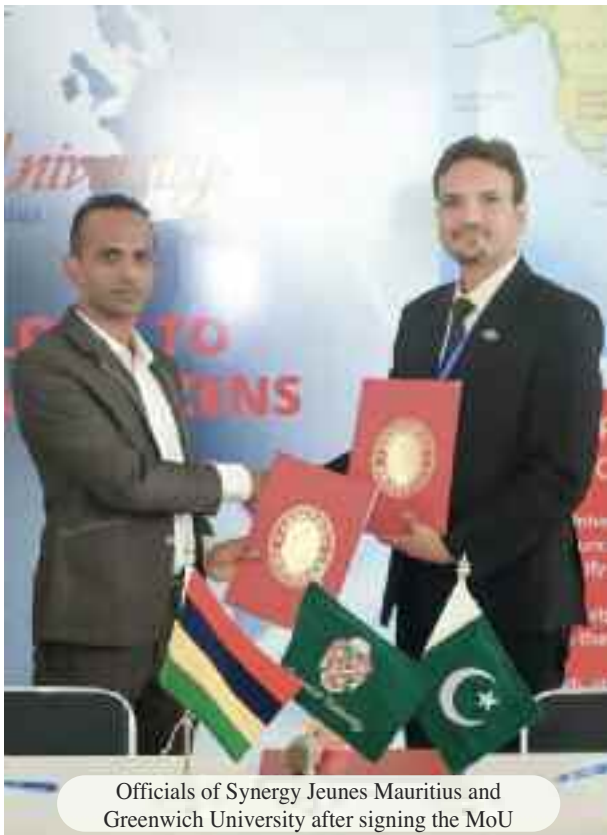
Officials of Synergy Jeunes Mauritius and Greenwich University after signing the MoU

In this context, a two days Youth Entrepreneurship Forum Regional Competition was conducted at Greenwich University Mauritius Branch Campus on September 15 and 16, 2016