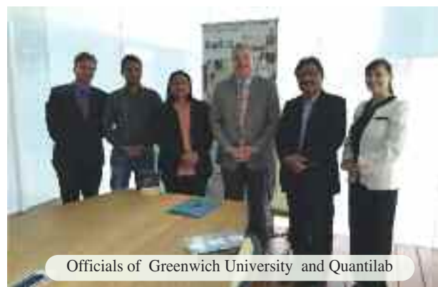
Officials of Greenwich University and Quantilab

Greenwich University has entered into joint collaboration with Quantilab in June 2016. The