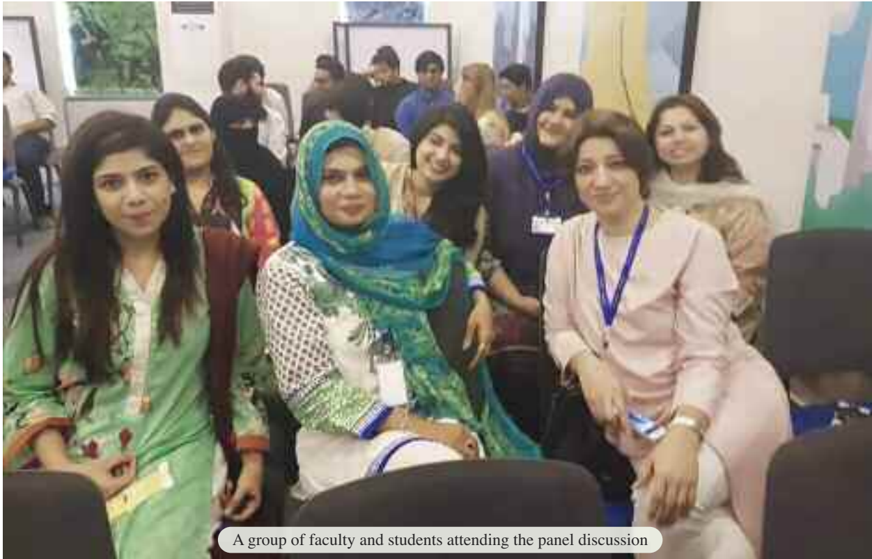
A group of faculty and students attending the panel discussion

The U.S. Consulate Karachi organized a panel discussion on Tuesday August 30, 2016 at Lincoln Corner Liaquat Memorial Library Karachi to celebrate youth achievements and encourage future innovation by promoting youth entrepreneurship through education to observe