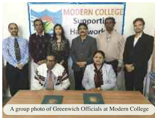
A group photo of Greenwich Officials at Modern College