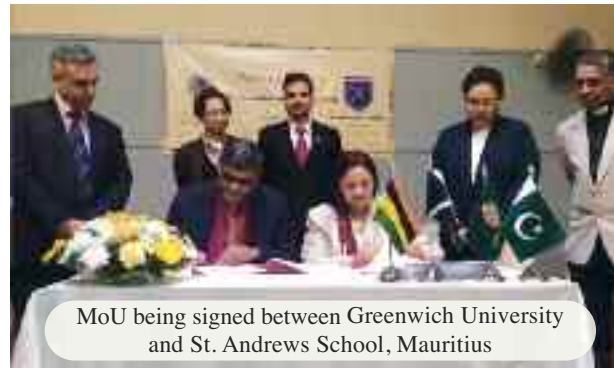
MoU being signed between Greenwich University and St. Andrews School, Mauritius

The ceremony was attended by the Archbishop of Mauritius and Indian Ocean, Acting High Commission of Pakistan to Mauritius, Chancellor Greenwich University,