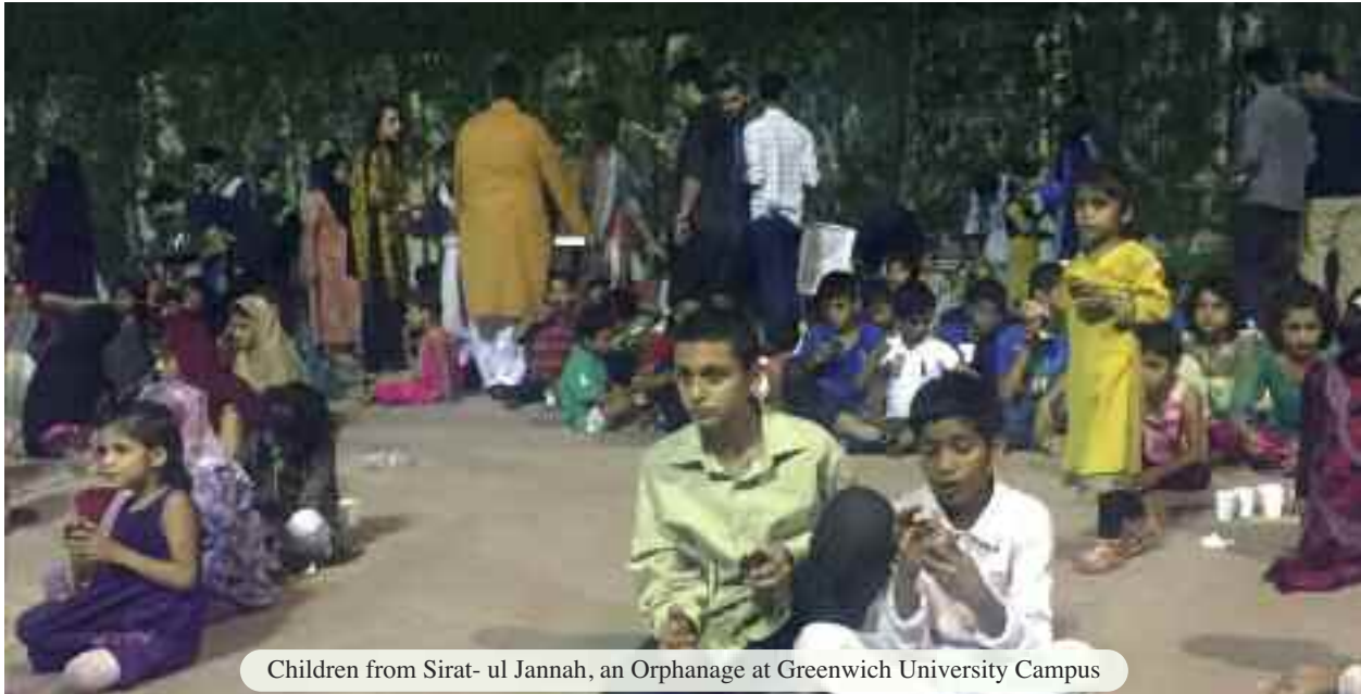
Children from Sirat- ul Jannah, an Orphanage at Greenwich University Campus

Every semester Sociology course gives the students an opportunity to interact with Sirat ul Jannah an orphanage and spend some time with them.