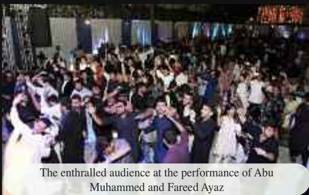
The enthralled audience at the performance of Abu Muhammed and Fareed Ayaz