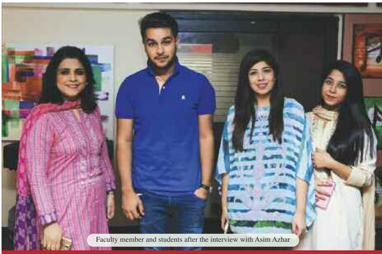
Faculty member and students after the interview with Asim Azhar

of getting into army and finally ended up being a singer.