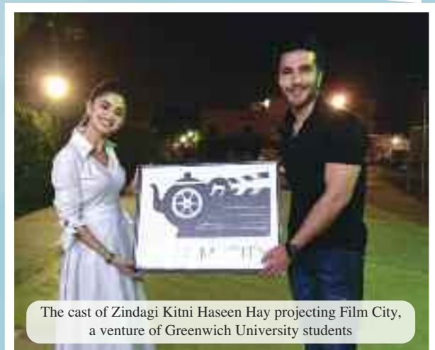
The cast of Zindagi Kitni Haseen Hai projecting Film City, a venture of Greenwich University students

The entire cast of Zindagi Kitni Haseen Hai, a Pakistani movie released on Eid ul Azha, visited Greenwich University on September 8, 2016. The students, faculty members and staff greeted them with extreme pleasure. Students made selfies and took photographs of these upcoming talent of Pakistani film industry.