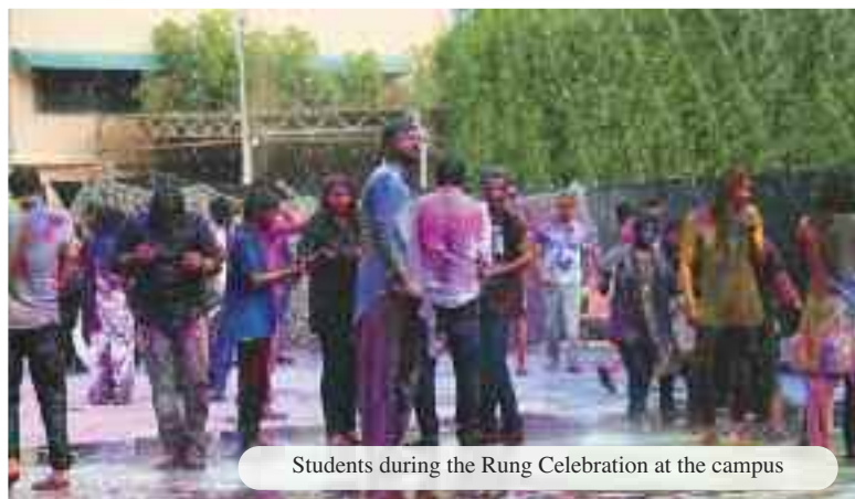
Students during the Rung Celebration at the campus

Rung, a colorful festival was arranged by the Student Development Council (SDC) at Greenwich University on July 23, 2016. A large number of students participated in this event making it an instant success.