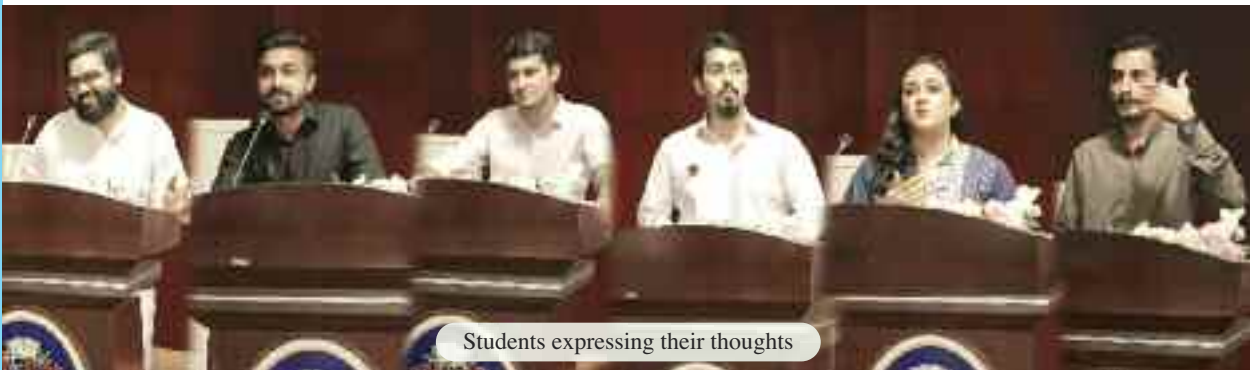
Students expressing their thoughts