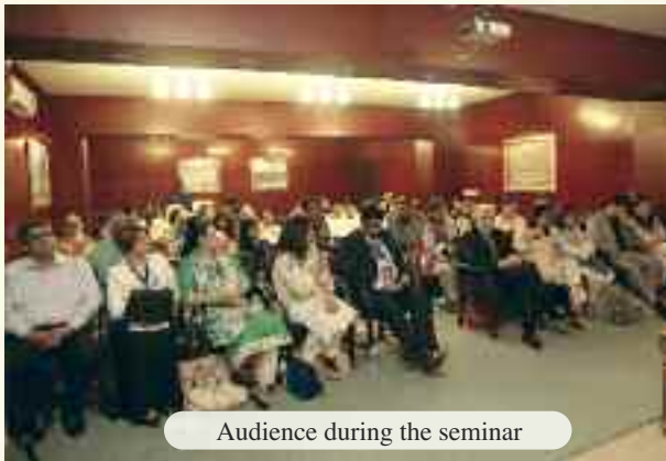
Audience during the seminar