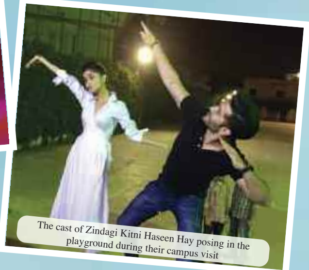
The cast of Zindagi Kitni Haseen Hai posing in the playground during their campus visit