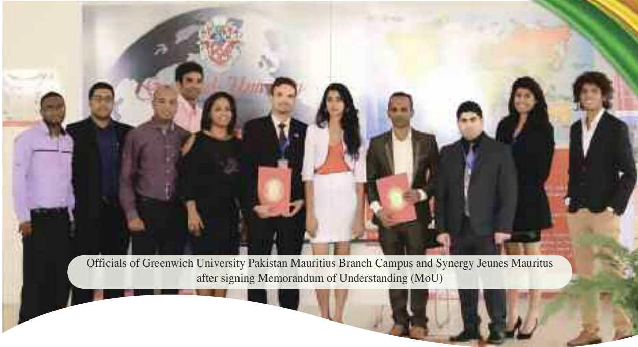
Officials of Greenwich University Pakistan Mauritius Branch Campus and Synergy Jeunes Mauritius after signing Memorandum of Understanding (MoU)

Greenwich University is to spread quality education across the globe. Greenwich University is determined to make Mauritius, which is a beautiful country of beautiful people as an educational hub in African Continent”.