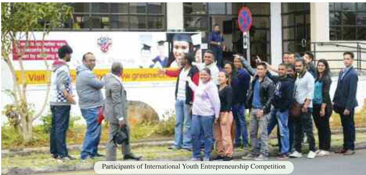
Participants of International Youth Entrepreneurship Competition

At this occasion the most Reverent Archbishop of Indian Ocean and Bishop of Mauritius said in his address that "Hope is the main objective of the humanity, and in order to bring hope to the youth, courage, boldness and success needs to be inculcated in the students". The Acting High Commissioner of Pakistan said in his address that "He is happy to see the relationship of Pakistan and Mauritius are growing and through the Floor of Greenwich University, the people of Mauritius will be coming to know about Pakistan's rich culture and tradition". The Chancellor, Greenwich University said that "Mission of