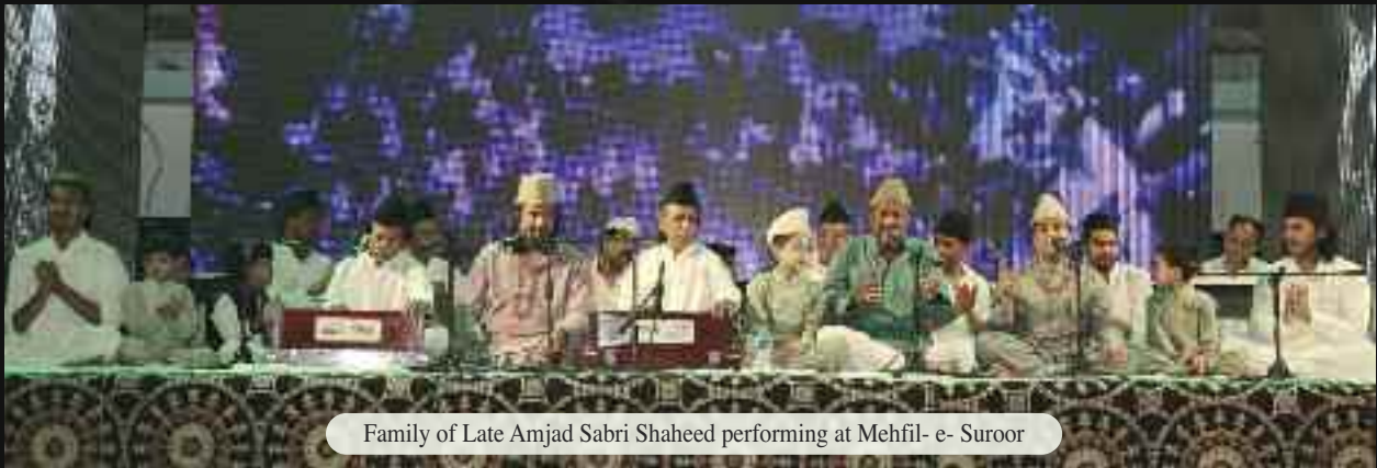
Family of Late Amjad Sabri Shaheed performing at Mehfil- e- Suroor