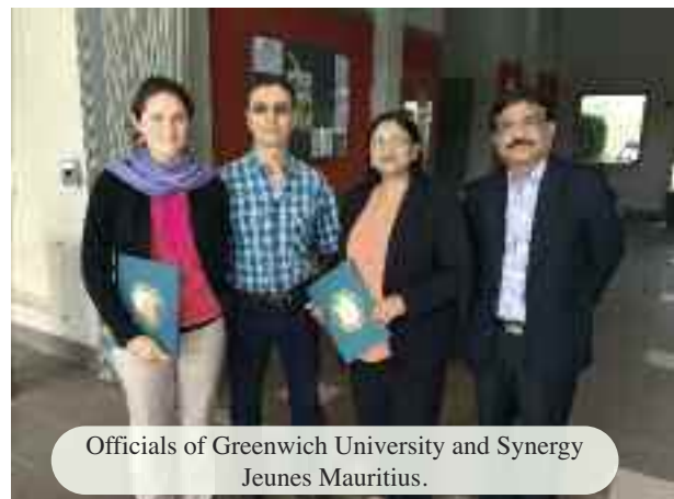
Officials of Greenwich University and Synergy Jeunes Mauritius.

In June 2016, Greenwich University signed a Memorandum of Understanding with Modern College, Mauritius. The aim of signing this MoU is to organize training