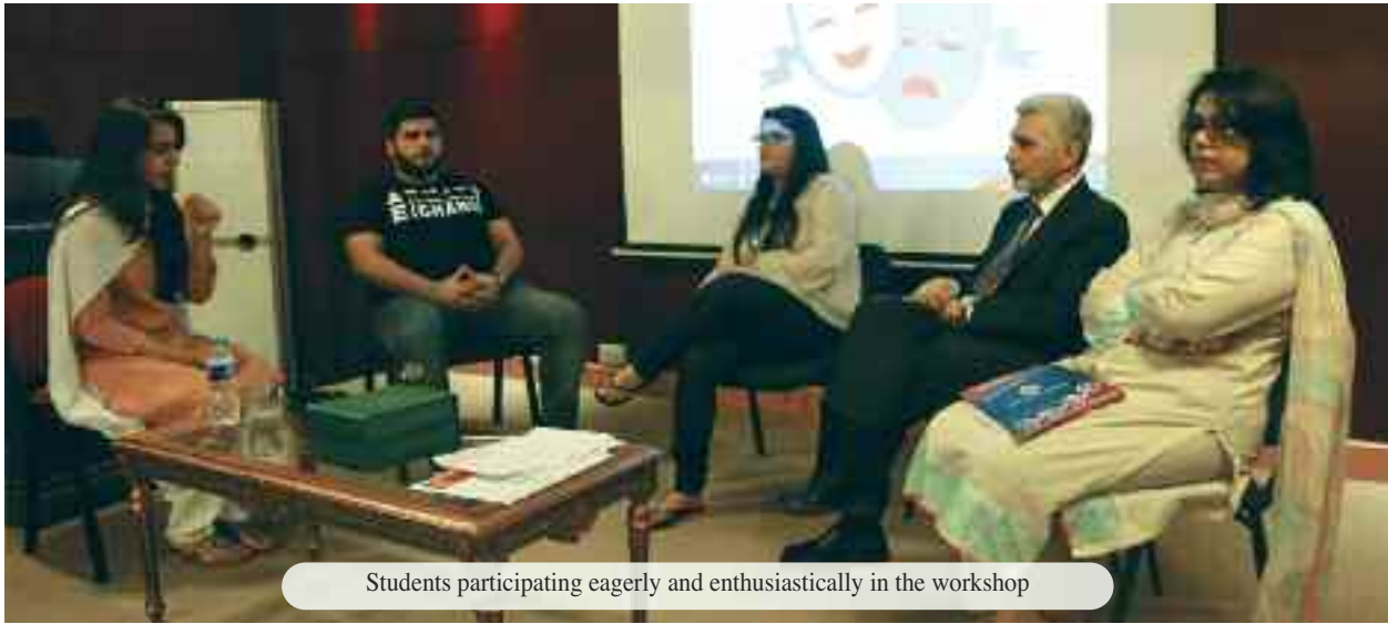
Students participating eagerly and enthusiastically in the workshop

First impressions count, and the first impression that a potential employer will have of you, is going to depend on how you present your cover letter, resume and how you behave in your job interview.