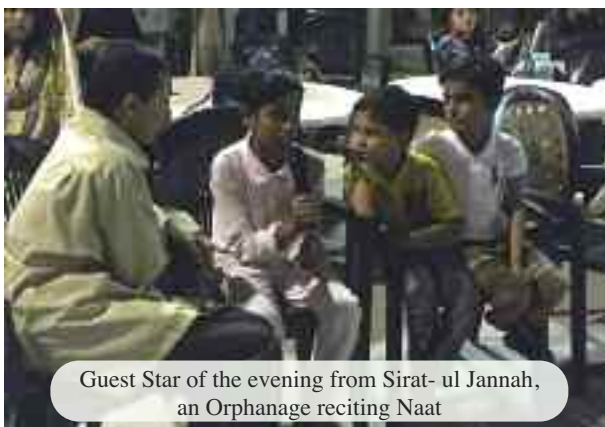
Guest Star of the evening from Sirat- ul Jannah, an Orphanage reciting Naat