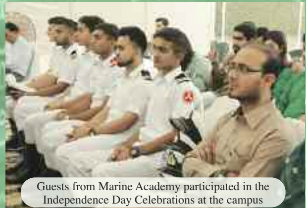
Guests from Marine Academy participated in the Independence Day Celebrations at the campus