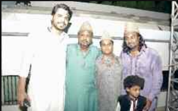
Family of Late Amjad Sabri Shaheed invited at Mehfil-e -Suroor