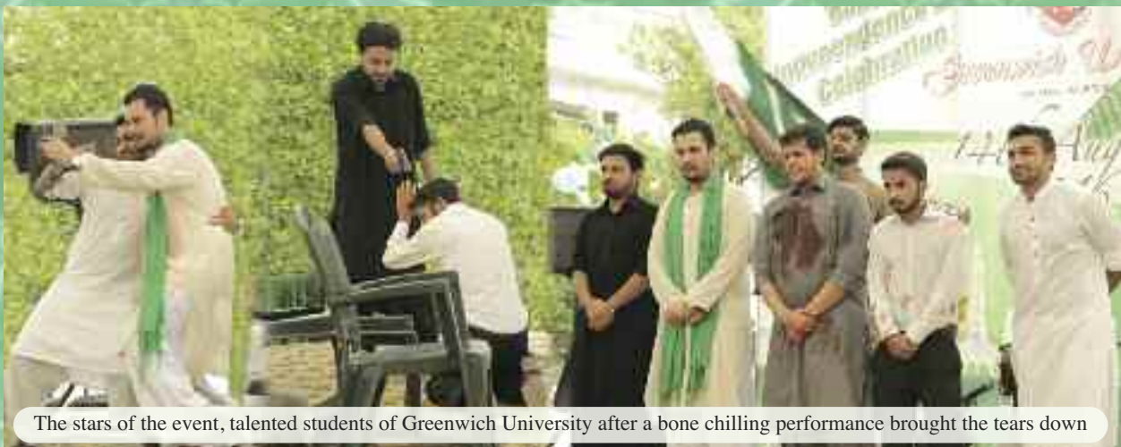
The stars of the event, talented students of Greenwich University after a bone chilling performance brought the tears down