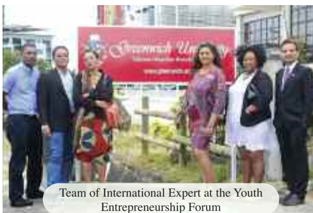
Team of International Expert at the Youth Entrepreneurship Forum