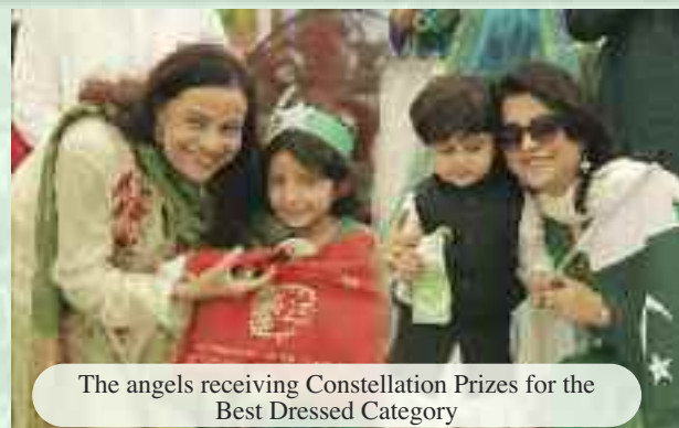
The angels receiving Constellation Prizes for the Best Dressed Category