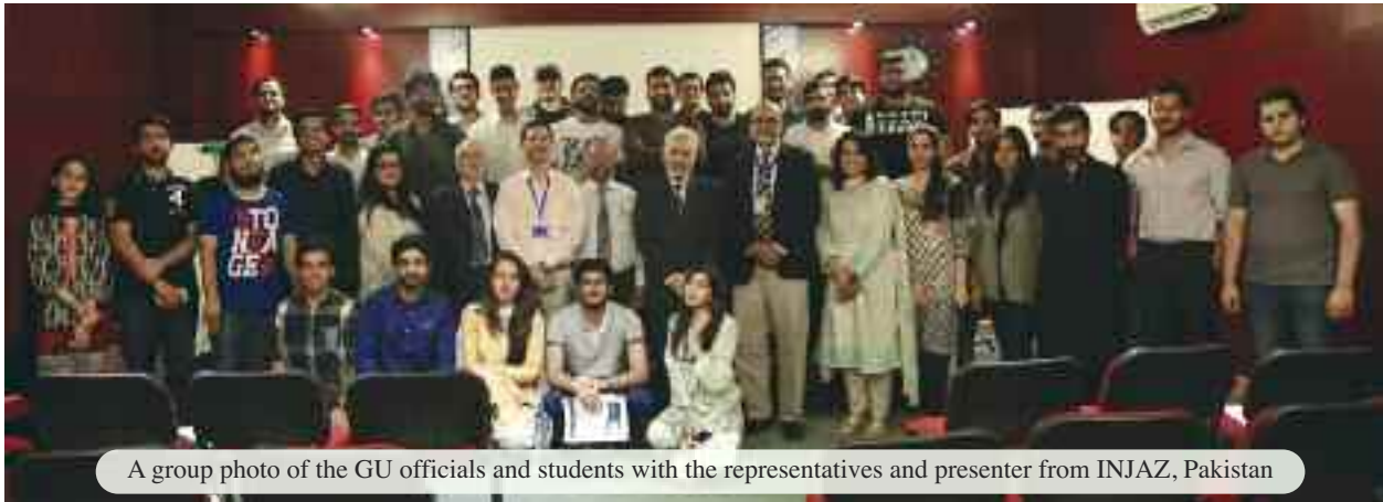
A group photo of the GU officials and students with the representatives and presenter from INJAZ, Pakistan