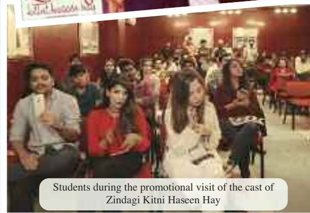
Students during the promotional visit of the cast of Zindagi Kitni Haseen Hai