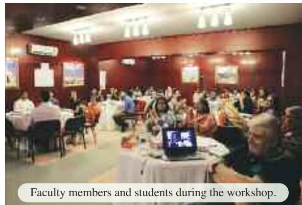
Faculty members and students during the workshop.

They were given tasks to write down their abilities and