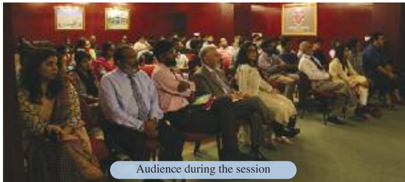
Audience during the session

Speaking on the occasion, research scholar and recipient of Sitara-e-