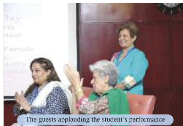
The guests applauding the student's performance

Both these women spoke of their struggle through life and the unwavering conviction due to which the world has learnt to recognize them.