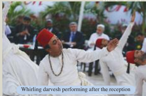
Whirling darvesh performing after the reception