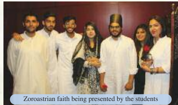
Zoroastrian faith being presented by the students