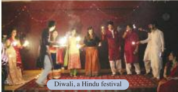
Diwali, a Hindu festival

table to show how life is rejoiced on this occasion. There were greens, coins, eggs, dried fruit, grape juice, coins and a mirror. These symbols have varied from time to time and evolution. There was a Navjot. The word "Navjote" is derived from the Avesta (ancient Persian) words "Nav" meaning New and "Jote" meaning Worshipper, and the ceremony is one of initiation into the Zoroastrian faith. In medieval Persian, the ceremony was called "Naozad" or "New Birth" signifying the rebirth of the child into the religion. The form of the ceremony has not basically changed in some nine thousand years since the first Navjote was performed by the Prophet Zarathushtra when the family of King Gushtasp became the first royal initiates into the faith.