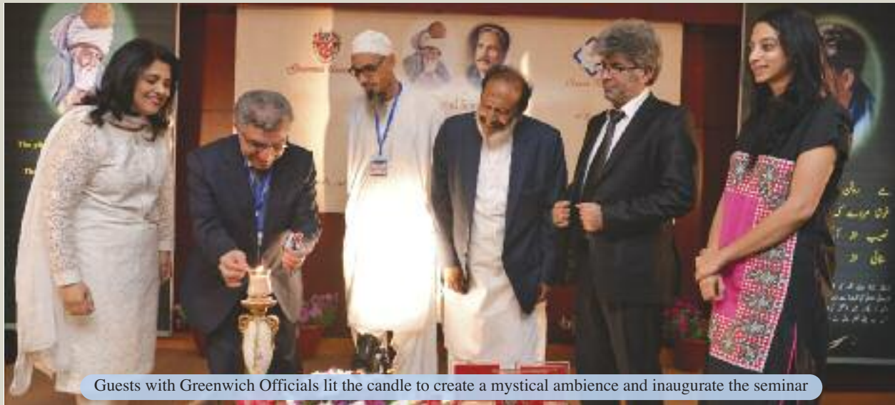
Guests with Greenwich Officials lit the candle to create a mystical ambience and inaugurate the seminar

Greenwich University in collaboration with the Rumi Forum organized an enlightening Seminar on Rumi and Iqbal on March 3, 2016 at Greenwich University.