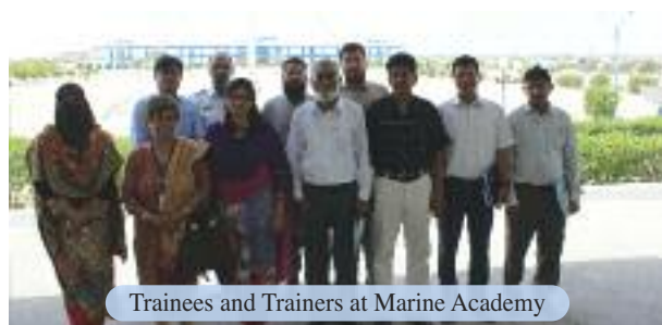
Trainees and Trainers at Marine Academy

The Merchant Navy is the name given to the international commercial shipping industry. It is made up of a large number of shipping companies who recruit their own Officer Cadets. Merchant seafarers, both officers and ratings, are civilians employed by these companies. Companies vary greatly in the size of ships, types of ships and areas of the world where they operate. Types of modern merchant ship include container ships, cruise liners, oil tankers, gas tankers, chemical carriers, bulk carriers, cable layers, Ro/Ro ferries, car carriers, oil-rig supply vessels and general purpose cargo ships. Their trade routes may take them to every continent and across every ocean on the globe.