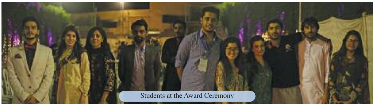
Students at the Award Ceremony