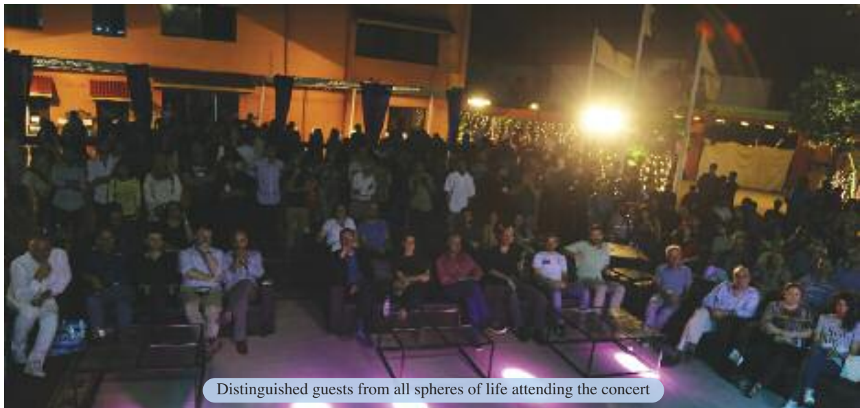
Distinguished guests from all spheres of life attending the concert