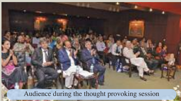
Audience during the thought provoking session