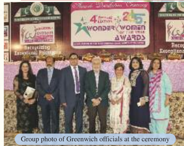
Group photo of Greenwich officials at the ceremony

Wonder Women of the Year Awards acknowledges the magnificent history of women achievements and brilliance. This esteemed honor is conferred every year to the most inspirational women of Pakistan who have done exemplary works and attained exceptional achievements in different walks of life, which uplift the progressive image of Pakistan.