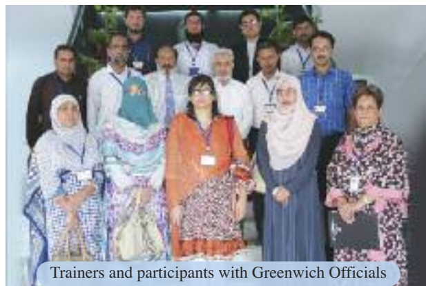
Trainers and participants with Greenwich Officials