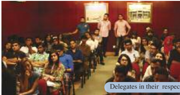
Delegates in their respective rooms during GUMUN