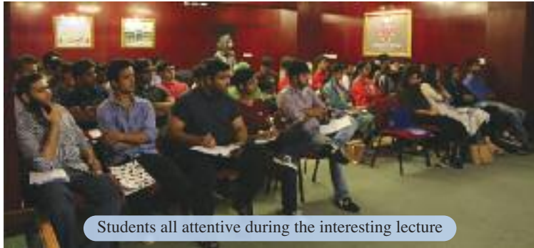
Students all attentive during the interesting lecture

“Writing Skills: Argumentative Essay.” English Composition Class