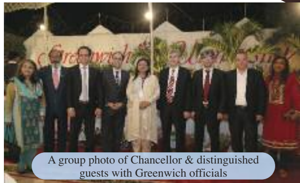
A group photo of Chancellor & distinguished guests with Greenwich officials