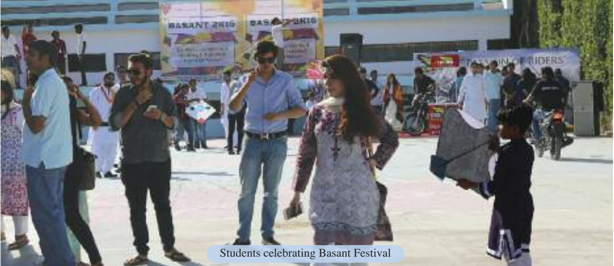
Students celebrating Basant Festival