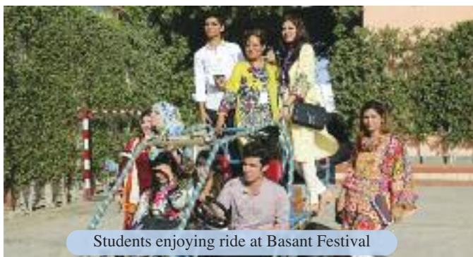
Students enjoying ride at Basant Festival