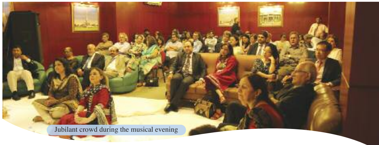
Jubilant crowd during the musical evening

along with faculty members, staff and students attended this dinner.