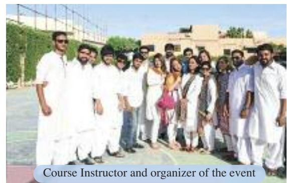
Course Instructor and organizer of the event