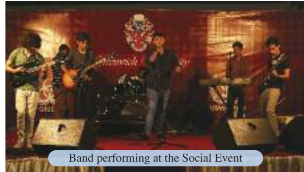
Band performing at the Social Event

Apart from all work, a qawwali session with Sabri Brothers was also arranged for the delegates on the first