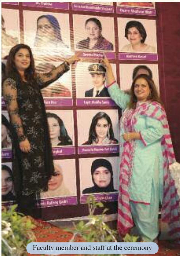
Faculty member and staff at the ceremony