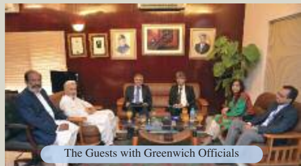
The Guests with Greenwich Officials