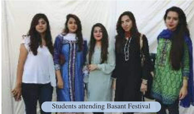
Students attending Basant Festival