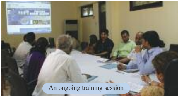
An ongoing training session

Greenwich University extended skills to the Marine Academy by conducting 14 contact hour training in May, and June, 2016. Pakistan Marine Academy (PMA) is the only institution in the public sector in Pakistan for training of seafarers. It is also the regional branch of World Maritime University Malmo, Sweden. PMA has meritorious standing among the galaxy of the world's elite institutions for training of Merchant Navy officers.