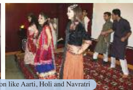
Students presenting the different festivals and rituals of Hindu religion like Aarti, Holi and Navratri