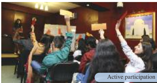
Active participation of students at GUMUN