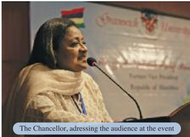
The Chancellor, addressing the audience at the event

The management and organizers of Greenwich University had invited dignitaries and distinguished guests from all over Karachi to attend this event and to pay respect to his Excellency. The event was attended by a crowd of people from different spheres of life.