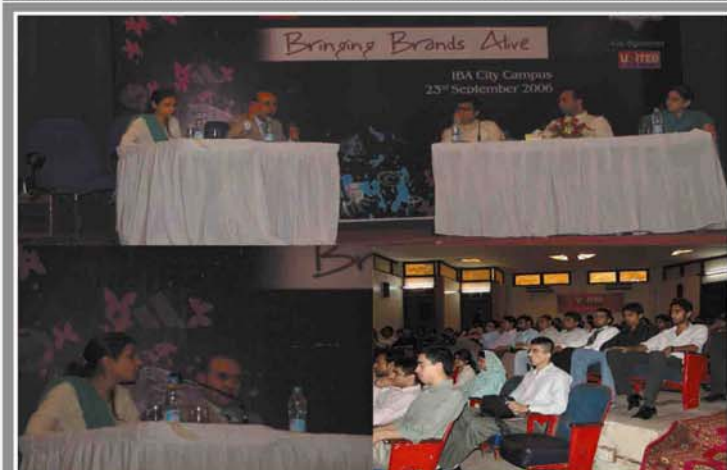
A group of Greenwich Students attended a seminar organized by IBA titled 'Bringing Brands Alive'. The event was organized in the format of a panel discussion and attended by IBA students and students and professionals from various organizations.