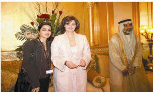
With Cherie Booth, UK Attorney and W/o Tony Blair, British P.M

This conference was for students, professionals, and women from all walks of life to learn, interact and network for long lasting global friendships.