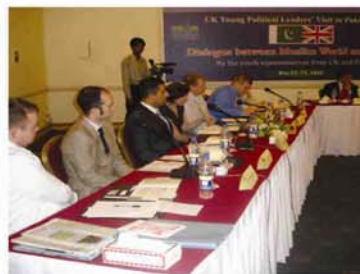
Young British Political Leaders from UK

On May 8th 2006, At Pearl Continental Hotel, Supported By: British High Commission And Piltad. Islamabad